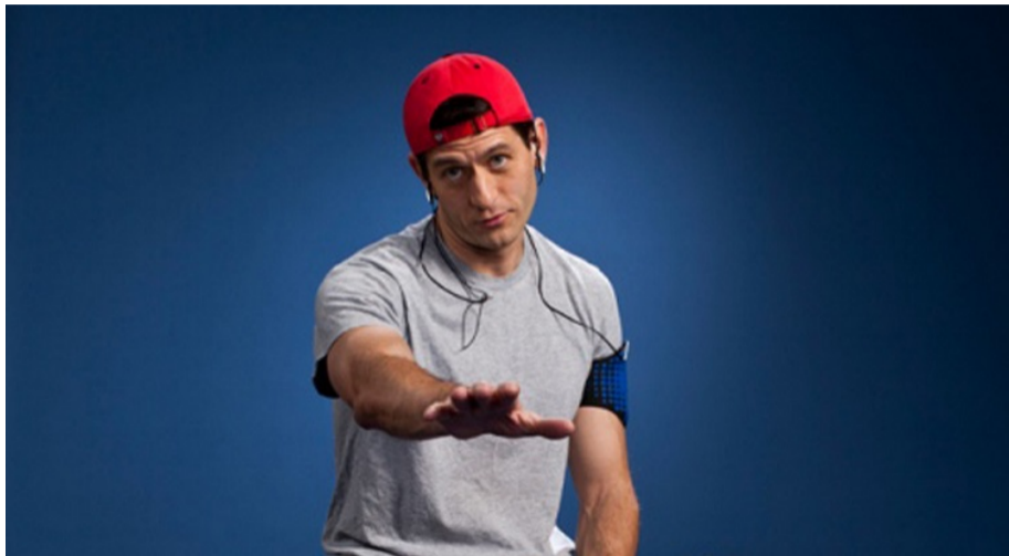
Figure 3: I'll never not include these photos when I can